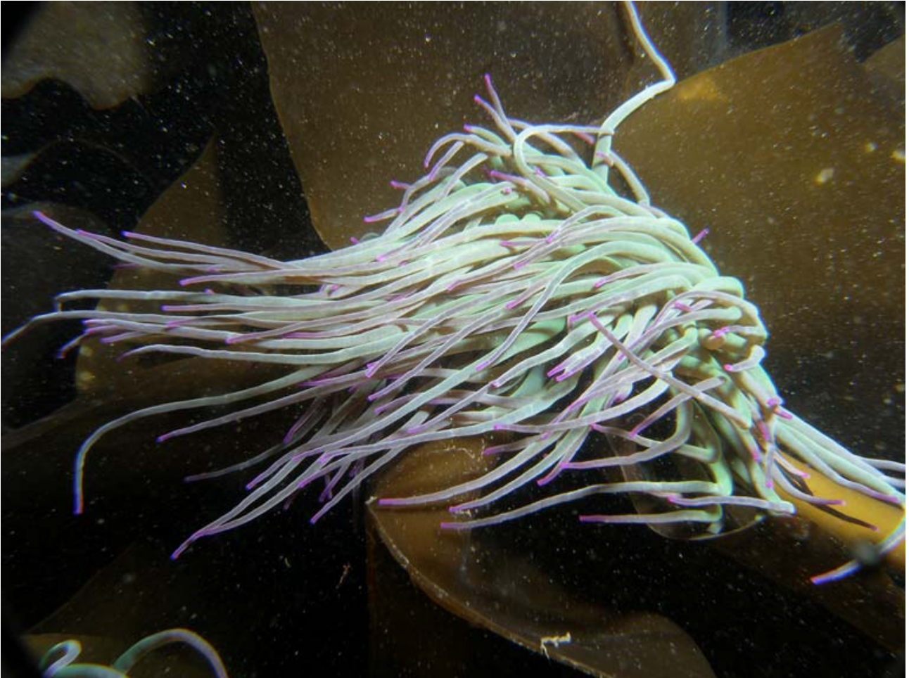
Figure. Green anemone on kelp

Consistent with surveys of populations in Portugal (Caldo et al., 2007) and Swanage (Whyte and Doggett, 2009) examples were recorded of anemones that contained both Inachus and P. sagittifer . More extensive surveying will be required to determine whether there is any competition between these two species for hosts, but our data do indicate that the presence of Inachus does not prevent the co-occurrence of P. sagittifer in the same anemone.